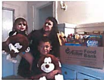
Family moved to the Obershaw House during the month of July 2016.

Two families entered the Obershaw Program during the months of July and August. One family, a 26 year old single female parent and two children moved in during the month of July 2016. The second family moved in on August 4, 2016. The parent is a 25 year old single female with two children and is employed with Arrow Staffing Agency as a part time clerk.