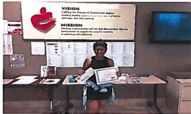
IDA participant holds the certificate for completing the IDA program and the check payable to her escrow company