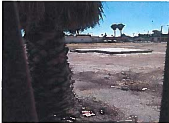
Structure removed adjacent to Obershaw after demolition

There are currently three (3) Passport participants enrolled in the program.